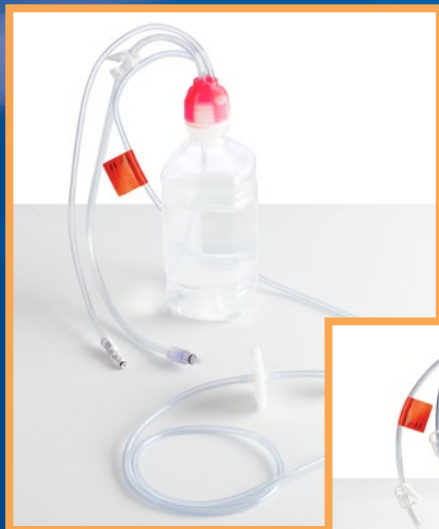
AquaShield® system consists of cap, tubing, connector, & 24-hour use sticker

The disposable AquaShield® system offers an alternative option to reprocessing reusable water bottle systems.