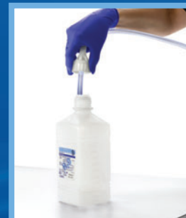
Irrigation tubing connects to sterile water supply (water bottle not included)

For more information on the Velocity® irrigation system, contact US Endoscopy today.