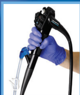
Velocity® system connects directly to your endoscope