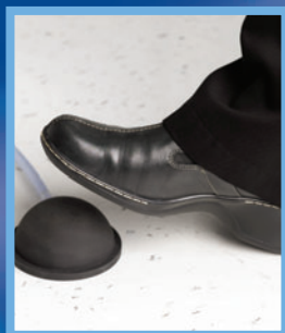
Easy-to-use manual foot pump

The Velocity® irrigation system includes an easy-to-use manual foot pump and irrigation tubing that connects directly to your endoscope and sterile water supply.